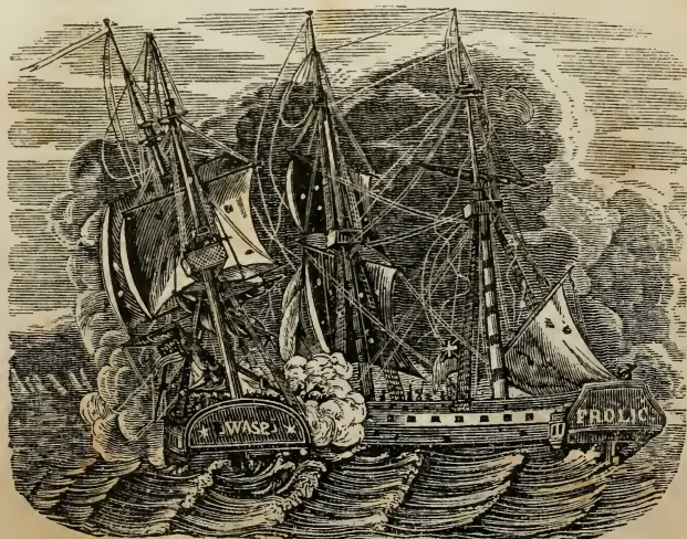
BATTLE OF THE WASP AND FROLIC.....COMMODORE JONES.